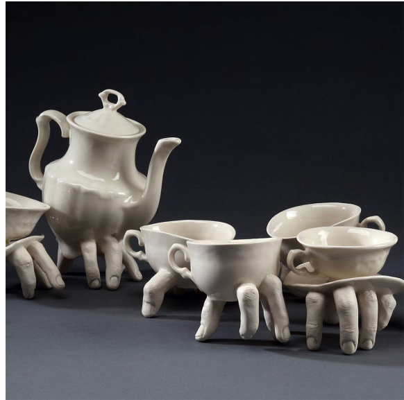
Ronit Barranga Surreal Ceramics